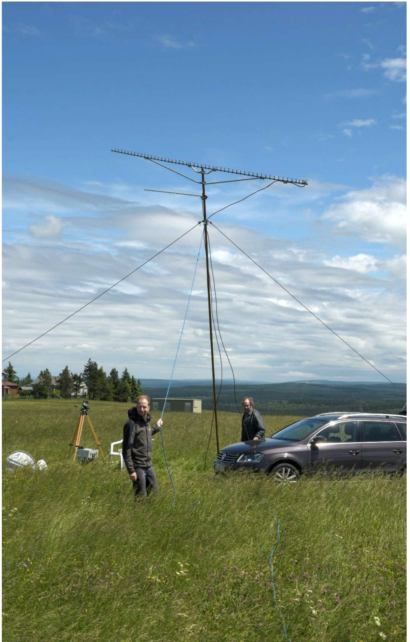
„Großfunkstelle Hirtstein“ JO60OM mit DH1DM & DG2DWL